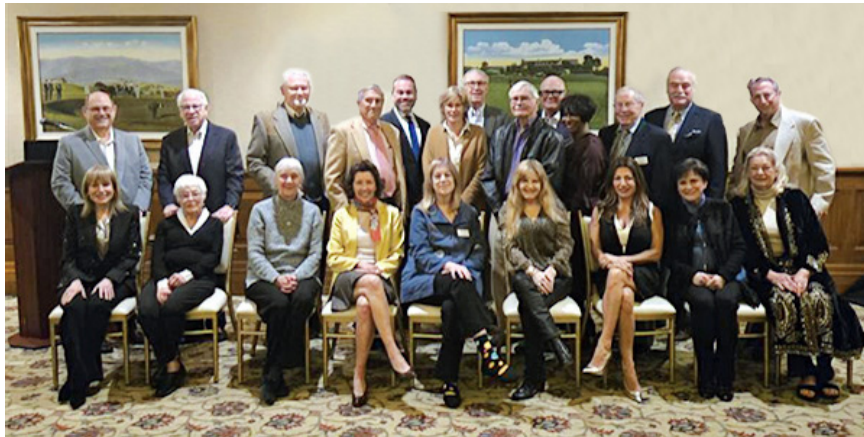
Benefactors and Patrons enjoy their annual appreciation dinner in March 2025.