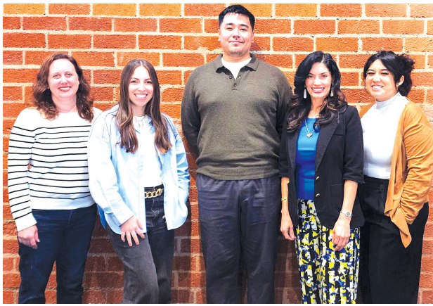
Program Staff at Cancer Support Community

I'm so pleased to be serving as Cancer Support Community's (CSC) Program & Clinical Director. Starting a new position during the immediate weeks after the Eaton Fire served to motivate me to find new ways to engage and reach the individuals we serve. Without a doubt, this catastrophic fire upended the lives of thousands in our community, including participants, volunteers, staff, and Directors who are part of our CSC family. Many lost their homes and many more were displaced.